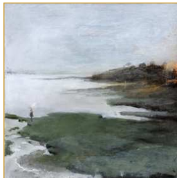
"The Fact Checker," 18" x 18"